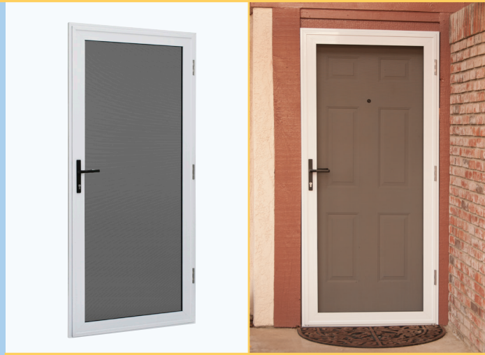
VISTA SECURITY SCREEN® HINGED SECURITY DOORS

Vista Security Screen™ Hinged Doors are often the first line of defense to protect you and your property. Vista Security Screen™ Hinged Doors are available to accommodate a wide range of swinging door applications, either in an interior or exterior mount configuration. All Vista Security Screen™ Doors are manufactured with 316 marine grade black powder coated stainless steel mesh. Vista Security Screen™ Doors are architecturally designed to easily incorporate into aluminum, vinyl, or wood framed openings, for both new and existing structures.